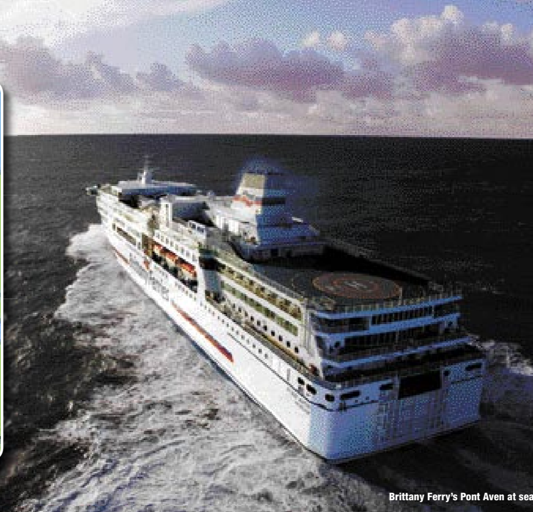
Brittany Ferry's Pont Aven at sea