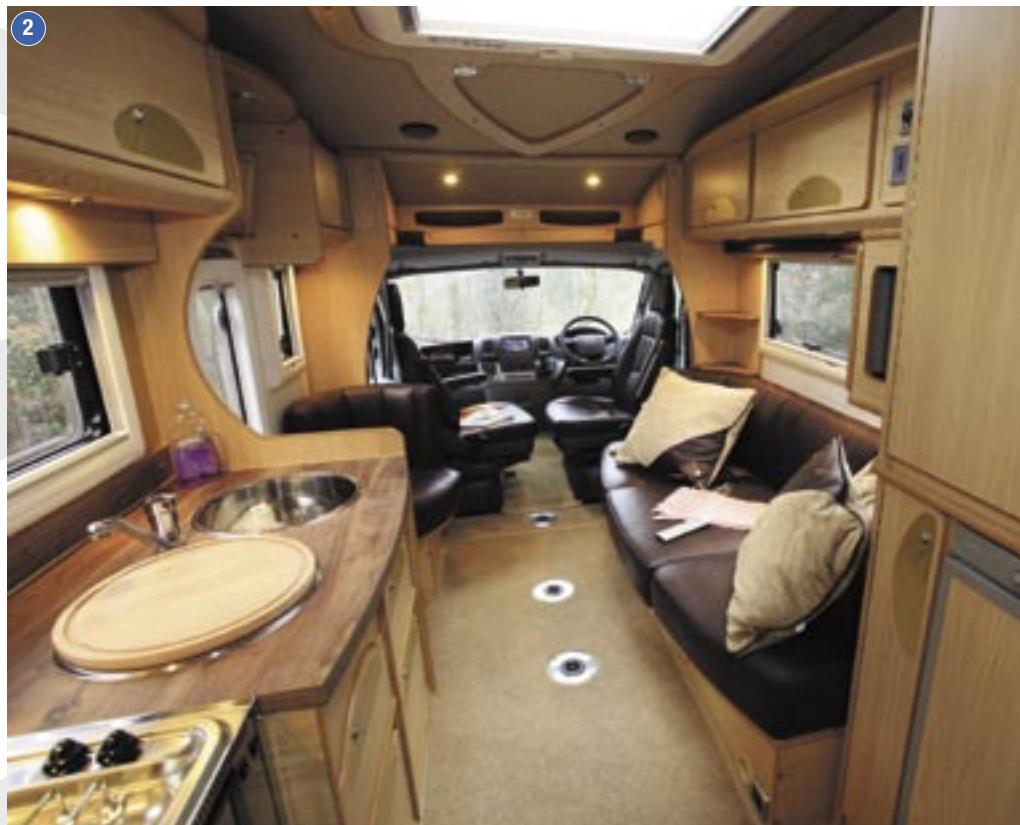
2 Swivel cab seats and lounge-to-die-for give way to amidships kitchen and wardrobe