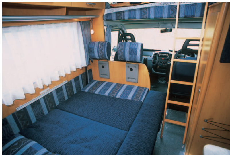
ABOVE LEFT: The roomy comfortable upstairs bed. The ridiculous little light up here is positioned almost under one pillow.