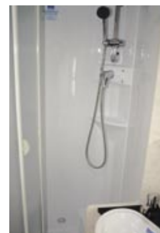
The shower cubicle is excellent and one of the best features

are fitting in the caravans. It's so large that it leaves almost no room for tipping dregs down the sink before putting the pots and utensils into the bowl. Things also get worse when you then try to empty the bowl into the sink – particularly when the bowl is full of dirty water.