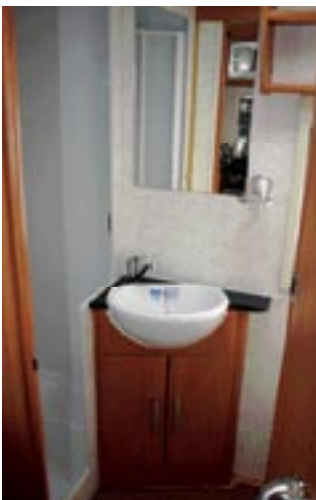
The generous sized washbasin is set into a corner unit with plenty of space for toiletries