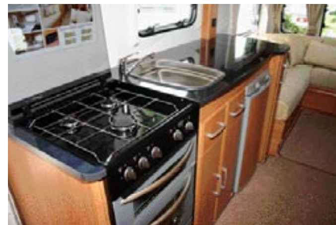
The kitchen is well appointed and has plenty of worktop space

In order to maximise the amount of worktop space, the stainless steel sink has been mounted north/south rather than east/west. This didn't worry me although I have heard comments from some caravanners that they prefer the east/west positioning. However, it is a fact that the north/south configuration does result in more worktop space. I was less happy with the size of plastic washing up bowl which all manufacturers – not just Lunar –