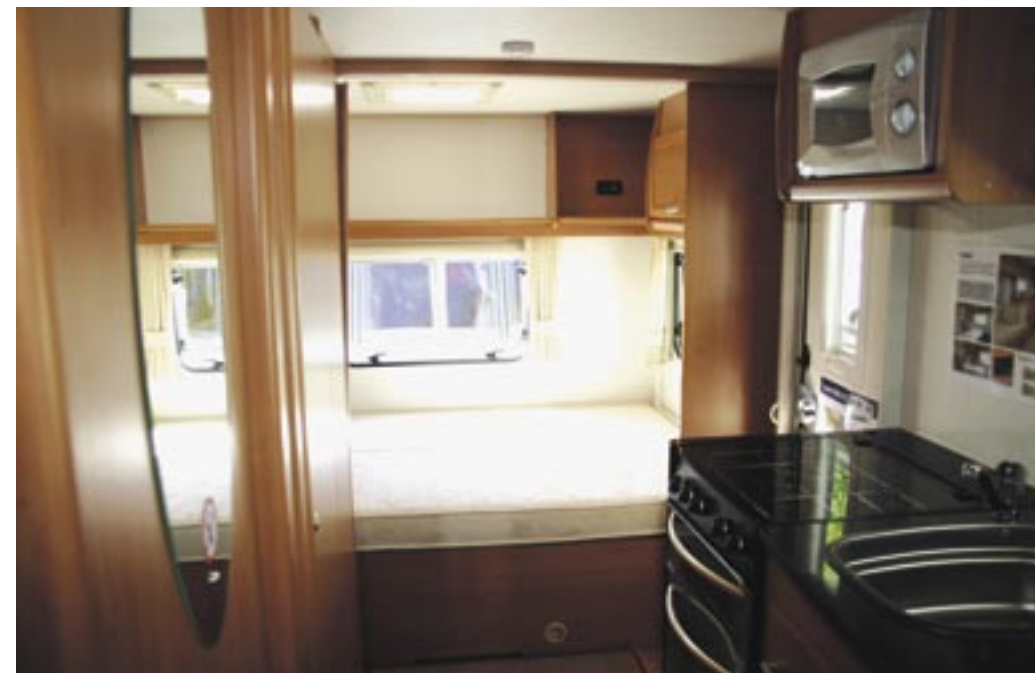
The fixed bed runs along the rear wall of the caravan and may not be to everyone's liking. At night a sliding door cuts the area off from the rest of the caravan

compartment light and airy. As I said, not a large compartment but nonetheless, perfectly adequate for a family's needs.