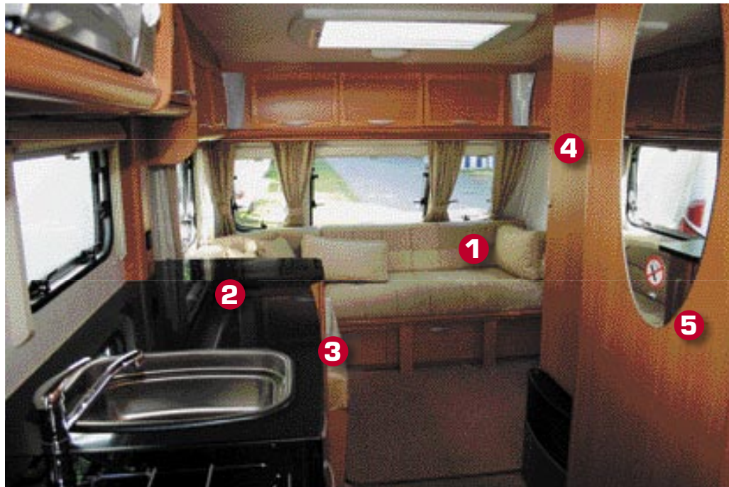
1. L-shaped front lounge for the CSL 2. An impressive amount of worktop space due to the north/south sink 3. Smaller fridge capacity disappoints 4. The wardrobe isn't over-generous 5. Washroom houses a full-sized shower cubicle

WHEN I first saw this particular Lunar Lexon I had expected to see the single-axle, fixed bed, four-berth 580 CSL, which wasn't even mentioned in the company's latest brochure. The L stands for L-shaped layout, differentiating the model from the one I had expected to see – the conventional CS with its two bench seats, one down each side in the front lounge area.