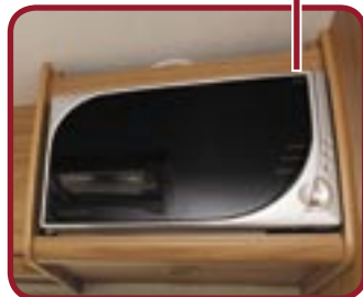
Even the microwave oven is stylish, with black and silver-effect door