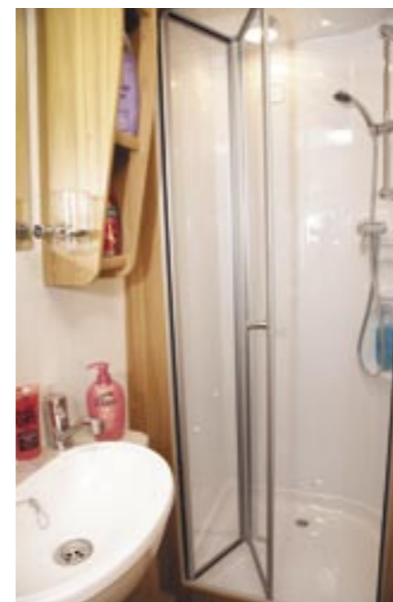
All you need is here in an end washroom

The curtains are of a chenille-type fabric in a brown that keys superbly with the whole tone - and also links interior décor to exterior styling. The 2010 Clubman graphics employ a bronze-ish shade plus a metallic grey, in three