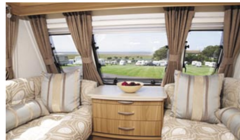
Upholstery of great style in light-reflecting fabrics creates a splendid lounge