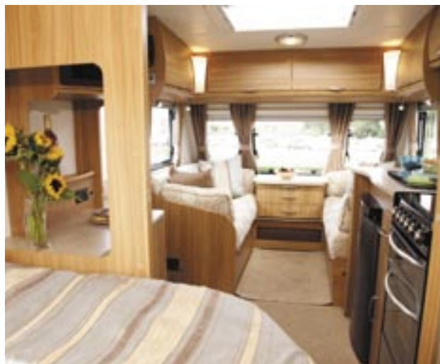
The SE looks and feels a luxury caravan from every angle