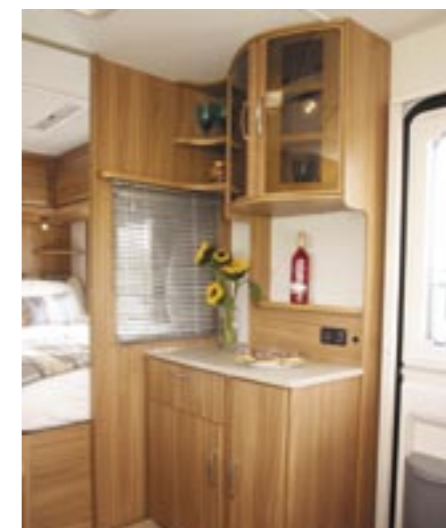
This cabinet provides extra kitchen surface