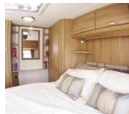
The bed cushions and cover are by Jonic Bedding