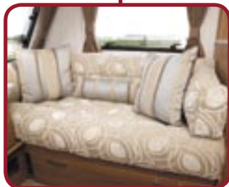
Six cushions ensure lounge comfort that's simply sumptuous