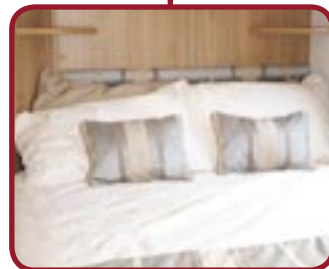
The bedroom feels well separated from the living area