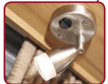
Spotlights: every caravan has them but these are simpler than most