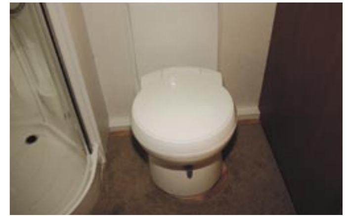
Washroom has Thetford's latest C250 swivel toilet with an electric flush

for the TV/DVD and above them a small shelf and the cocktail cabinet with its LED lights.