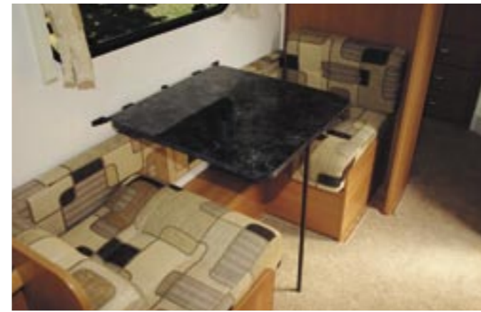
Two seat dinette makes into a single bed at night

However, I would qualify the number of beds because at 1.80m (5ft 10in) the bench seats aren't long enough, in my opinion, to be considered single beds, whilst the