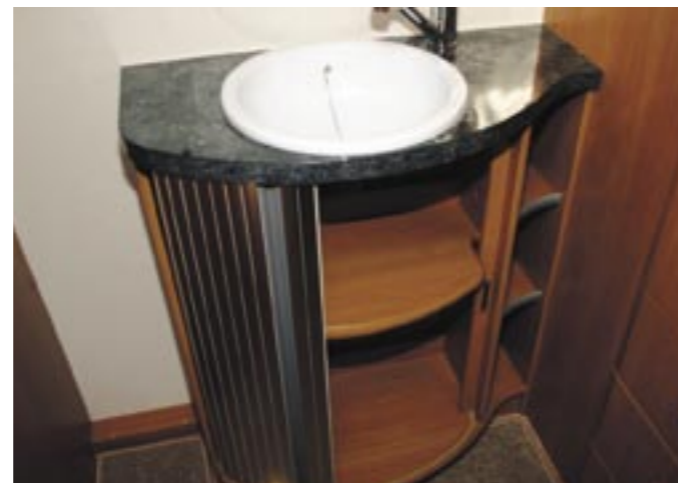
There's plenty of room for the family's toiletries in the cupboard below the washbasin