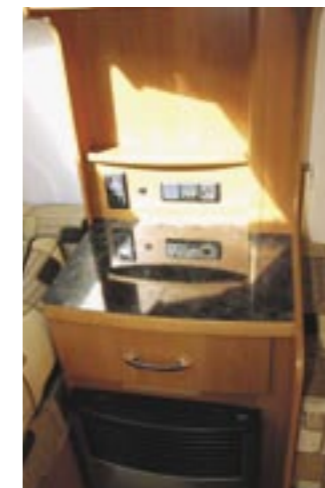
On the wall above the top of the dresser are the connections for the TV and DVD player