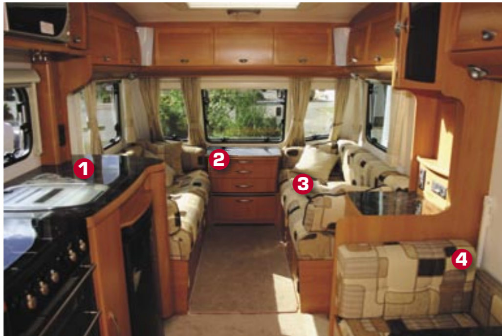
1. More worktop than most 2. Two of the Lunar's five drawers 3. Single beds at 5ft 10in 4. Side dinette makes a bed and bunk

T HE Lunar Clubman range seems to have been around since Adam was a boy. It has proved to be extremely popular with dedicated caravanners – not the least ralliers – who want a caravan which can take everything that rutted roads, tracks, and muddy fields can throw at it.