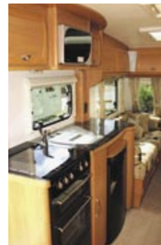
Only complaint about the kitchen is the high level microwave. Worktop space is in good supply

Between the front offside seat and the dinette is a dresser on which the Ultraheat space heater has been fitted. On the wall above the top of the dresser are sockets