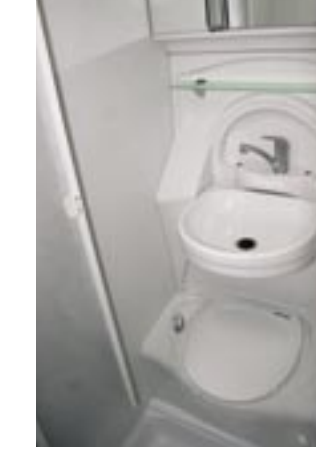
Tip-up sink better than any alternative

find it in the single-axle four-berth Meridien piece feel flimsy. It doesn't matter that the units 560-EK (£15,995); now that sounds appealing. BUILD QUALITY