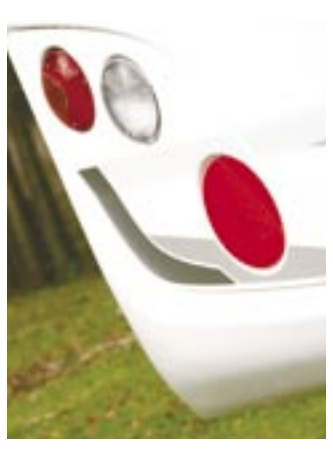
Swift and Elddis show Fleetwood how to do lights