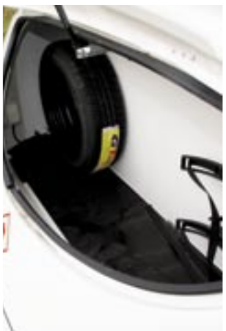
There's loads of room in here but access is only average