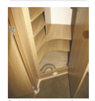
Practical design makes most of space

SWIFT GROUP LTD Dunswell Road, Cottingham, East Yorks HU16 4JX Tel: 01482 847332 Web: www.swiftcaravans.co.uk