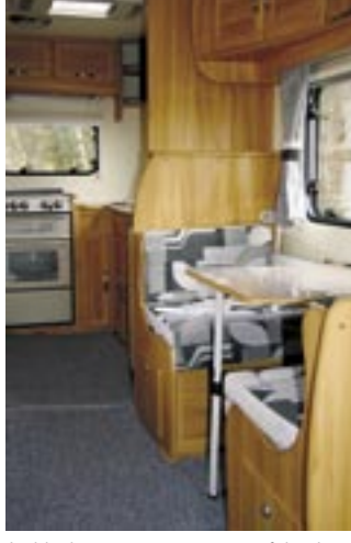
Inside the narrowest caravan of the three