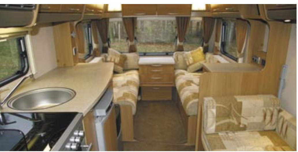
The lounge is the size of a barn