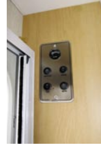
What could be simpler than this?