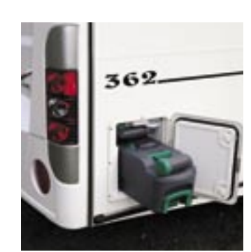
Family size waste cassette... for two