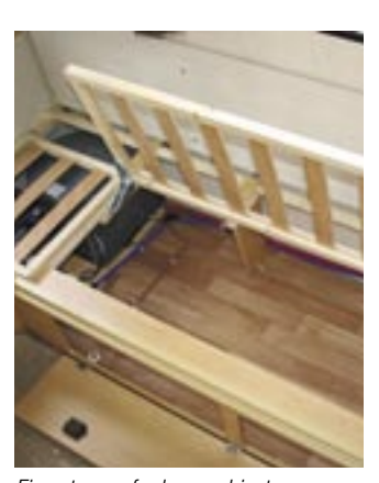
Fine storage for larger objects