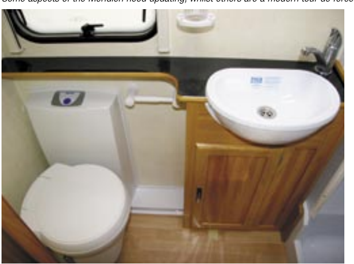
Washroom is basic, decoratively speaking, but it does have a separate shower