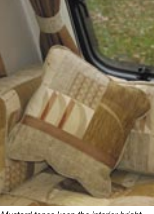
Mustard tones keep the interior bright