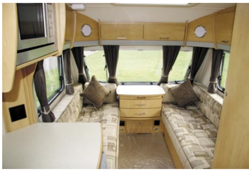
It looks wide for a tiddler, don't you think?