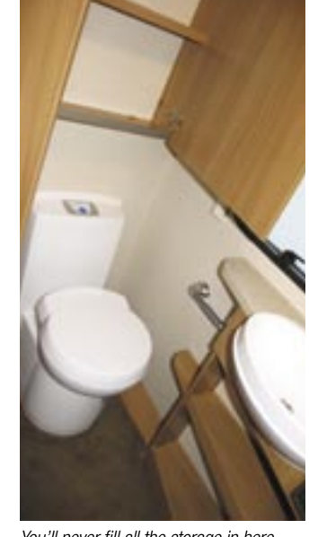
You'll never fill all the storage in here