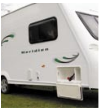
It's imposing, isn't it?