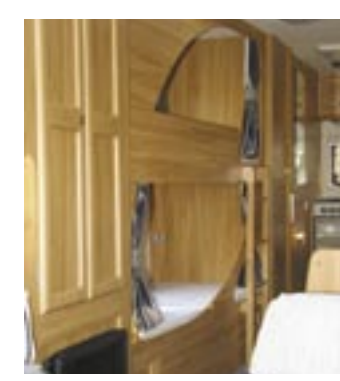
Flying buttress bunks dare to be different

FLEETWOOD CARAVANS LIMITED Hall Street, Long Melford, Suffolk CO10 9JP Tel: 0870 774 0008 Web: www.fleetwoodcaravans.co.uk