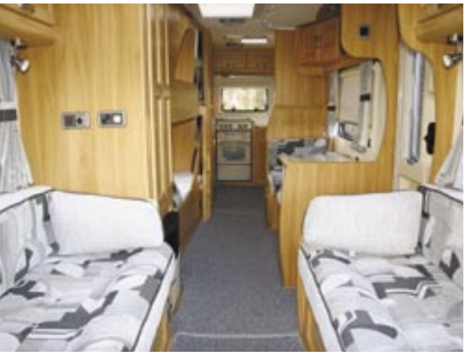
It grabs your attention; who said grey's drab?