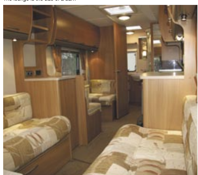
The Swift's interior reveals a practical four-berth