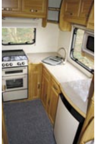
A practical genius of a kitchen

As you'd expect, all get stabilisers, but only the Avanté and Charisma wheels get shock absorbers.