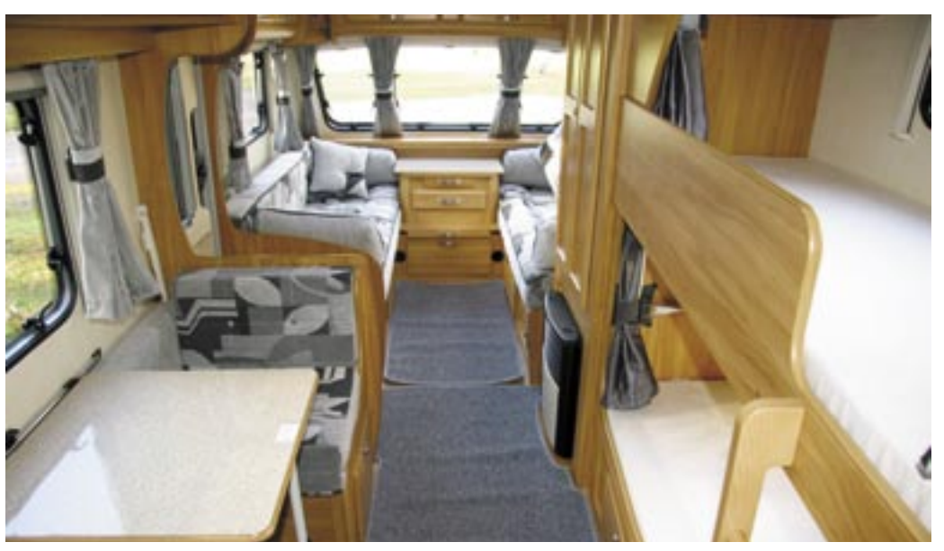
Some aspects of the Meridien need updating, whilst others are a modern tour de force