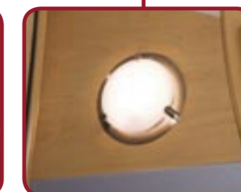
Porthole-shaped lights sit at each of the front corners, with a larger version in the kitchen area