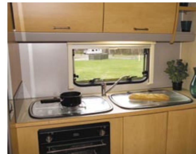
Kitchen area is surprisingly practical when you consider it's a small caravan

Axles: 1 Berths: 2 MRO: 997kg MTPLM: 1154kg Width: 2.24m (7ft 4in) Internal length: 3.73m (12ft 3in) Overall height: 2.73m (8ft 11in) Bed sizes: 1.83m x 0.71m (6ft x 2ft 3in); double: 2.07m x 1.37m (6ft 9in x 4ft 6in)