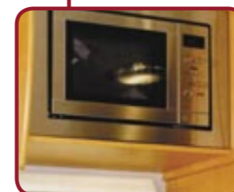
Just because it's small and lightweight, doesn't mean it lacks luxuries such as a microwave