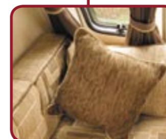
Chenille scatter cushions and plain brown curtains complete the classic look of the soft furnishings