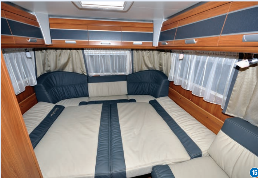
14 The drop-down bed is large and comfortable