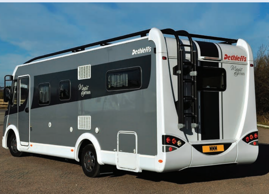
15 Rear lounge double bed is big, but bumpy

wardrobe) are required. The resultant bed is a good size when finished, but inelegant, with variable support from underneath.