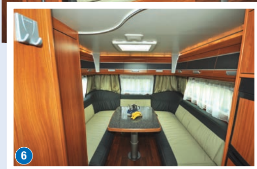
6 The rear lounge has a club-like atmosphere - its rooflight, however, is a tad small