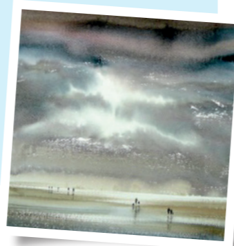
ART BY KEITH NASH

Learn how to capture dramatic skies, master essential techniques, and debunk common myths. Keith will explore setup, light effects and reflections! Watch a full demonstration, including a two-minute watercolour therapy session, and learn how to gain the confidence to create your own atmospheric landscapes. Whether you're a beginner or experienced artist, this session will spark your creativity!