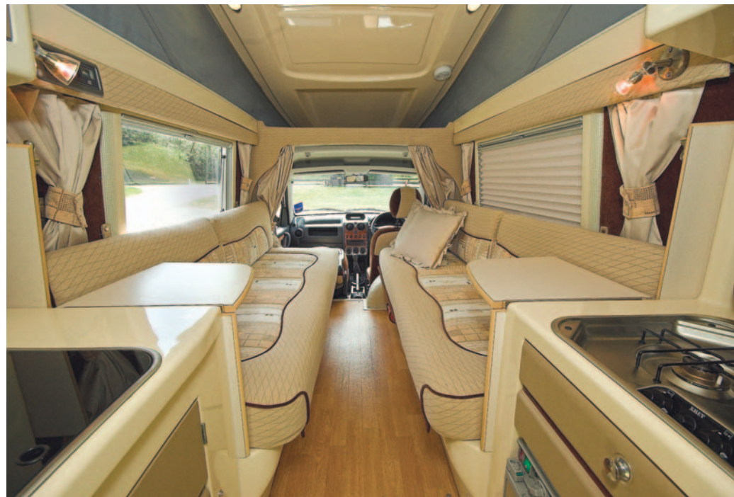
Fabrics and fittings all have a look of quality, while the clear central aisle makes the front end surprisingly spacious.

With the Peugeot you can feel the draught