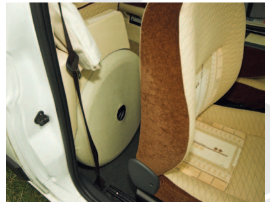
ABOVE: Tall drivers might find the spare wheel cramps their style.